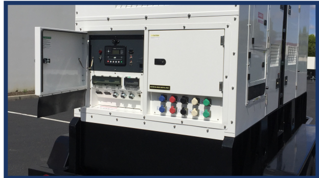
CUSTOMER CONNECTION PANEL