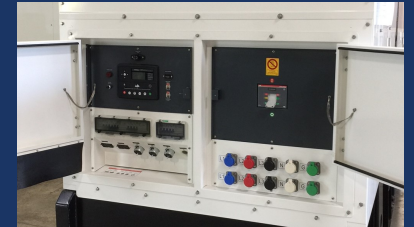
CUSTOMER CONNECTION CAM-LOK STANDARD