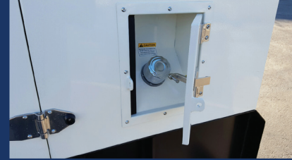
LOCKABLE EXTERNAL FUEL FILL