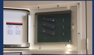
LINK BOARD VOLTAGE SELECTION