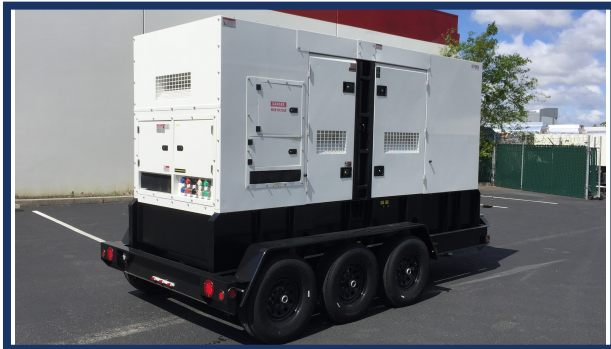
LARGE CAPACITY FUEL CELL

UQ-375: Standby Rating: 375kVA / 300kW Prime Rating: 340 kVA / 272 kW