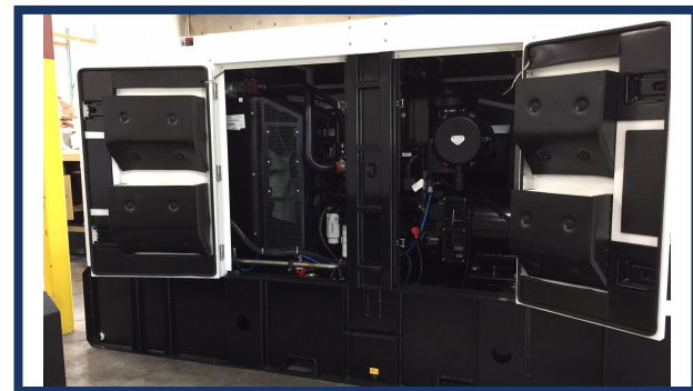
EASY ACCESS FOR MAINTENANCE